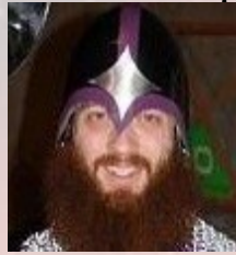
Jarl: Martin Henderson