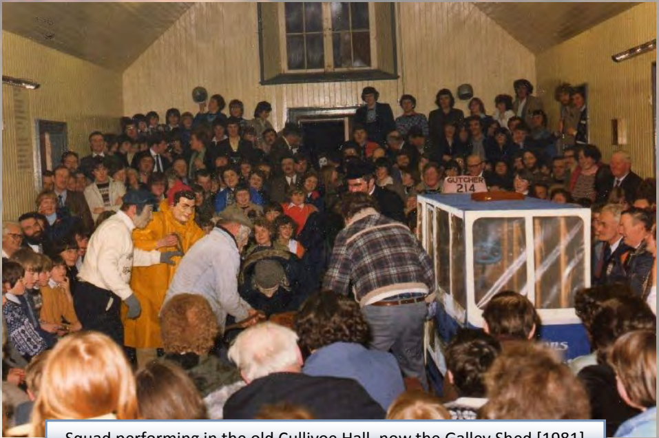
Squad performing in the old Cullivoe Hall, now the Galley Shed [1981]