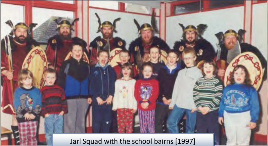
Jarl Squad with the school bairns [1997]