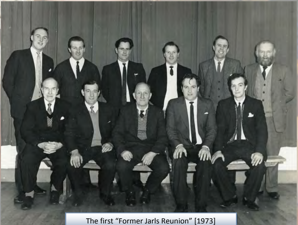
The first "Former Jarls Reunion" [1973]