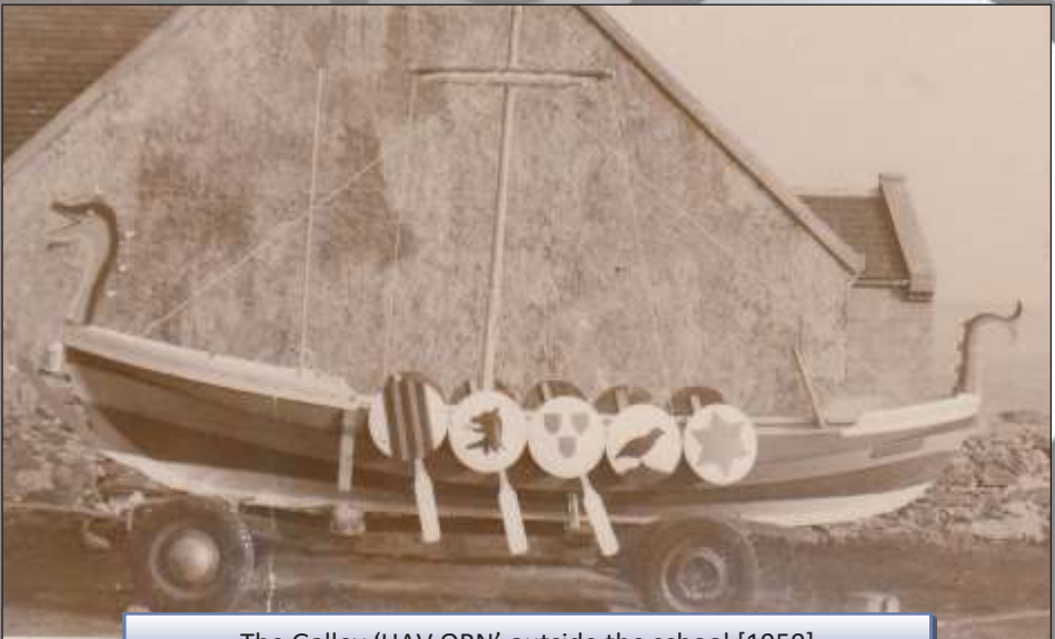
The Galley 'HAV ORN' outside the school [1959]