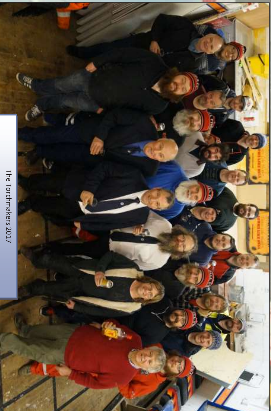
The Torchmakers 2017