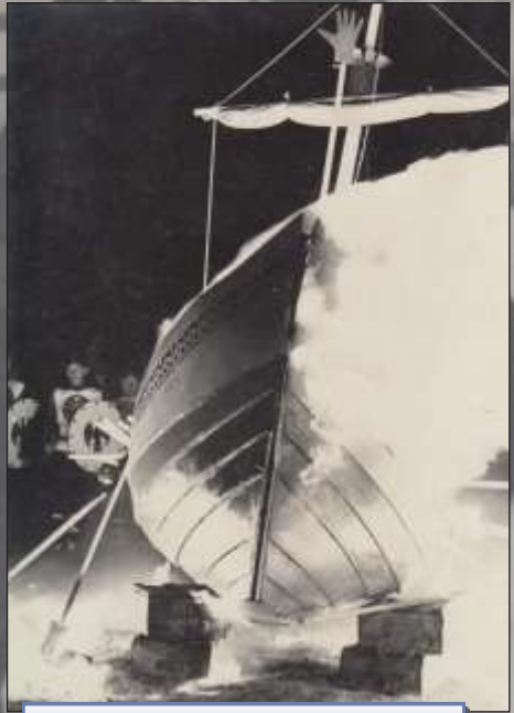
The galley "THOR" burning [1965]