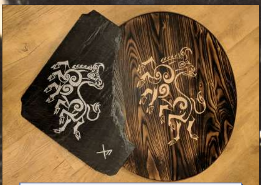
The original 'Octobeast' design on slate next to the Jarl's shield