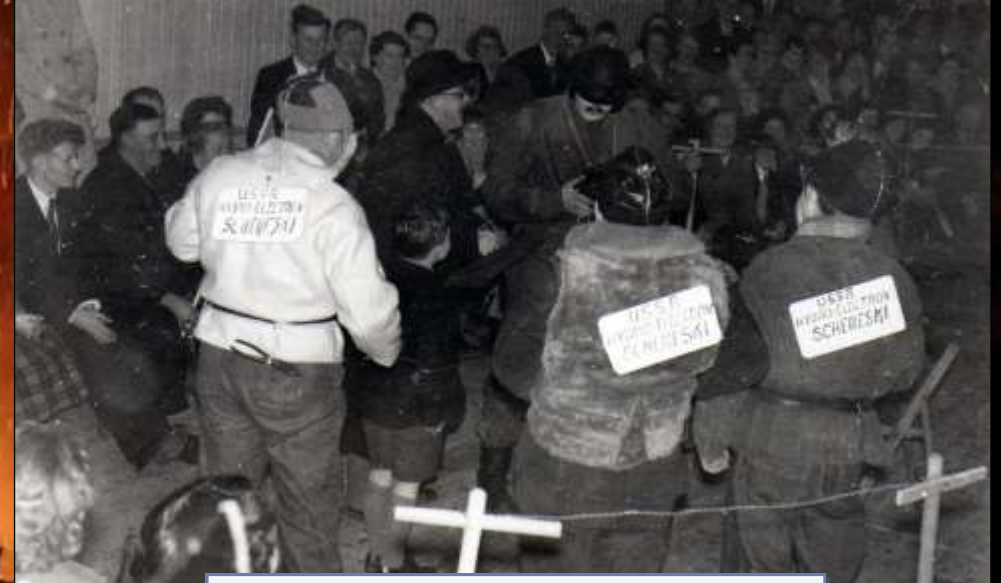
Squad 5 - "Russia Comes to the Rescue" [1961]