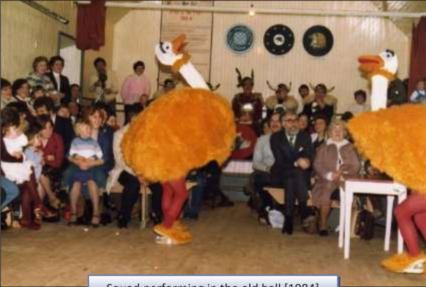
Squad performing in the old hall [1984]