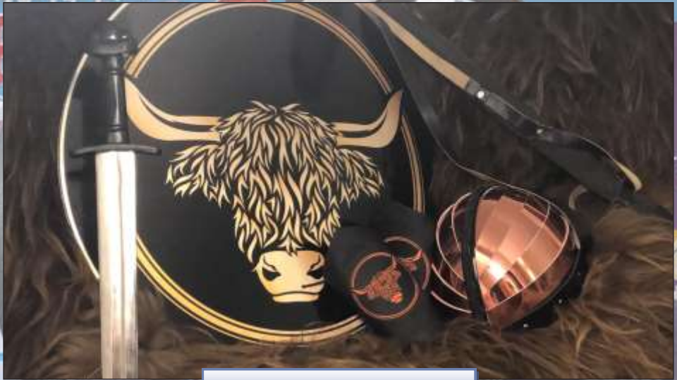
Jarl Squad Shield and Regalia