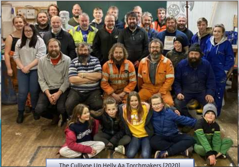
The Cullivoe Up Helly Aa Torchmakers [2020]