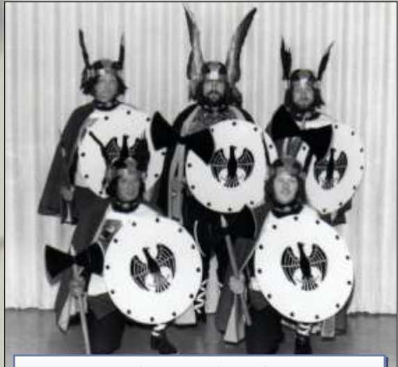
The 1977 Jarl Squad